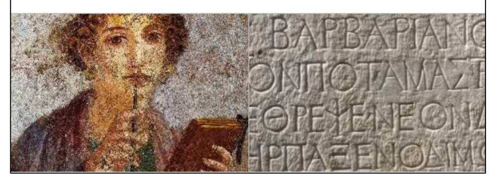
Figure 2 The EAGLE Newsletter - Snapshot