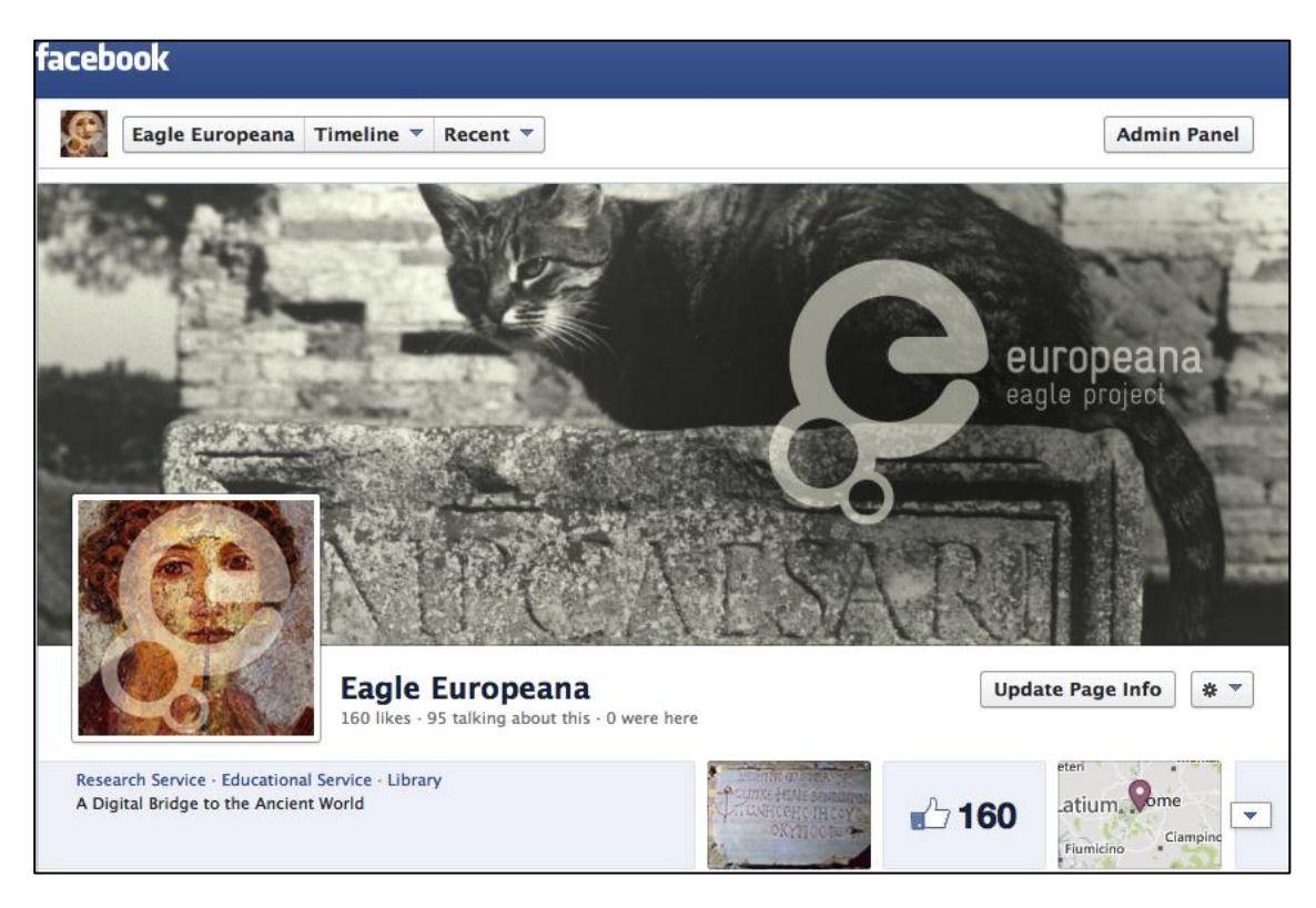
Figure 3 The EAGLE Facebook Page - Snapshot

Page: https://plus.google.com/u/0/100976832846535223203/about