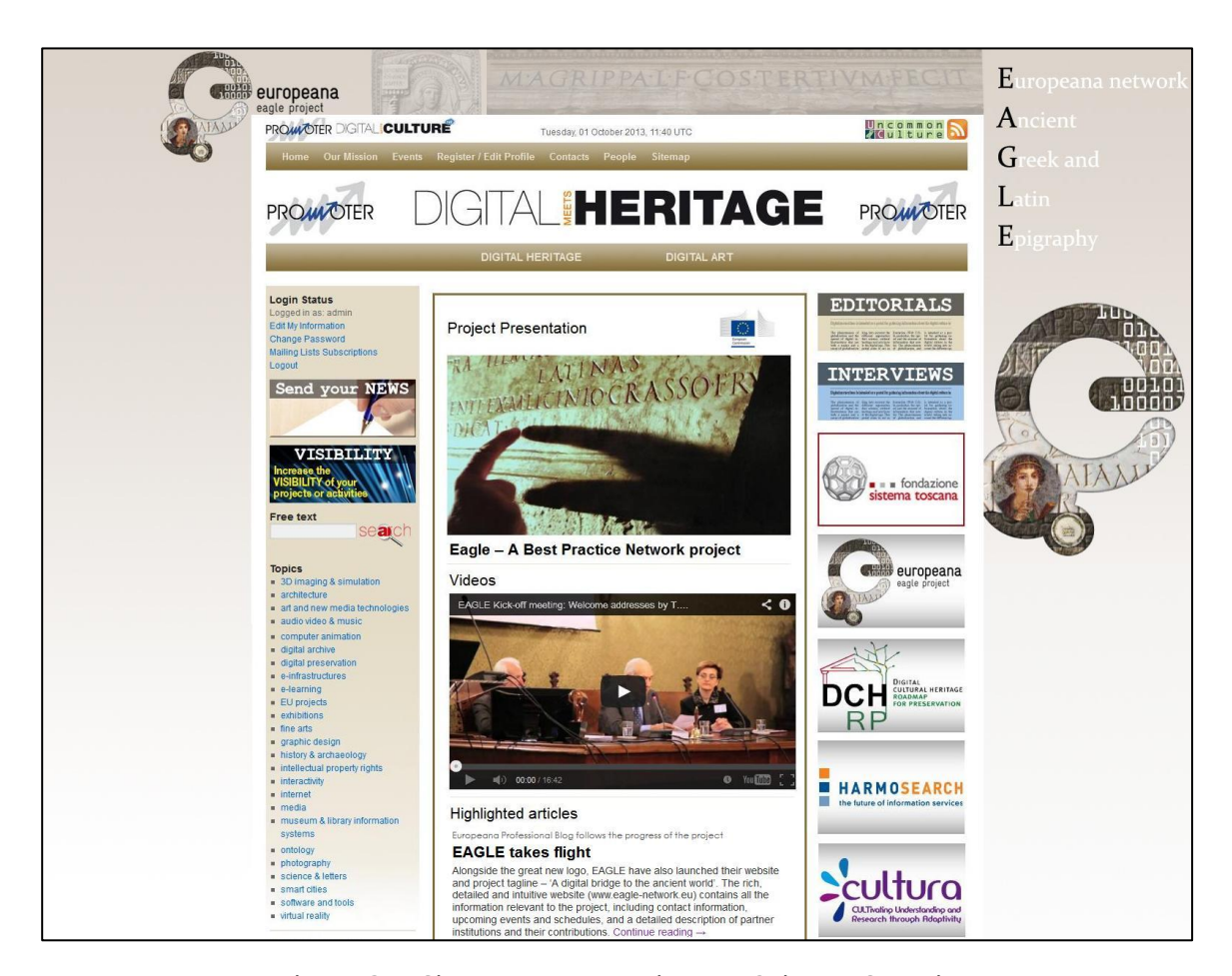
Figure 4 The EAGLE Showcase on Digital Meets Culture - Snapshot

• Digital meets Culture: an online magazine in the digital cultural heritage area dedicated to the themes of the digital technologies applied to cultural heritage and the arts. It is becoming increasingly popular, with over 50,000 visitors and 100,000 pages visited in the last year. EAGLE has a button permanently featured on the homepage (<a href="www.digitalmeesculture.net">www.digitalmeesculture.net</a>), providing easy access to information and news about the project. Short articles, interviews, showcases will be published on this online portal, thanks to the collaboration of our partner Promoter (see also D6.Eagle Project Website);