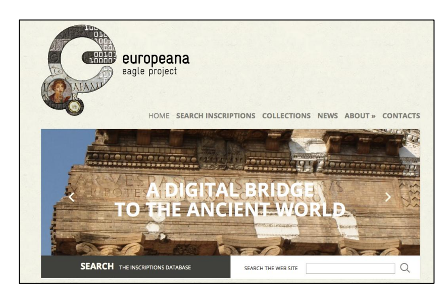
Figure 1 The EAGLE Website - Snapshot

• EAGLE Project Website : the main dissemination channel of the consortium is the project website: <a href="www.eagle-network.eu">www.eagle-network.eu</a>. The website has already been described in <a href="D6.1 EAGLE Project Website">D6.1 EAGLE Project Website</a>, which illustrates the website's aims, the users that it targets, the software used, the structure of the public and the reserved areas, the implementation work, the services, the editorial board, and the tools for monitoring the website.