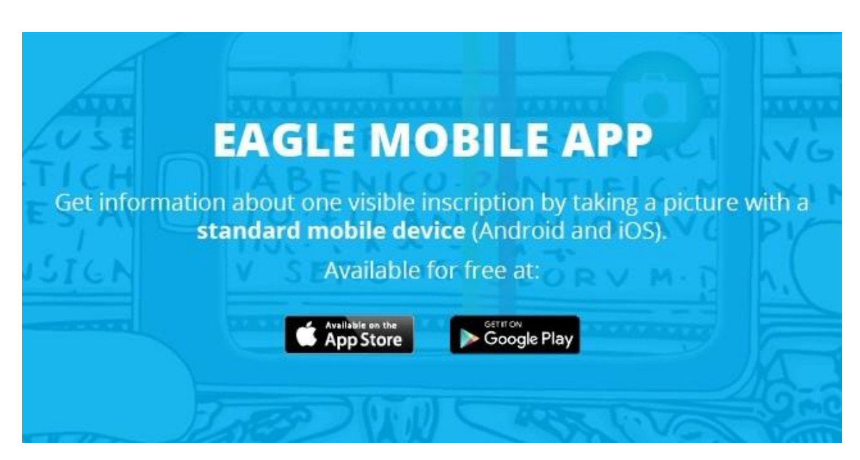
Figure 4 - Banner for the EAGLE Mobile Application

The services for registered users are now fully integrated with the EAGLE accounts. Registered users have access to the list of the queries and items from the chronology tab. Items and queries can also be saved and synced with the user account on the EAGLE web portal.