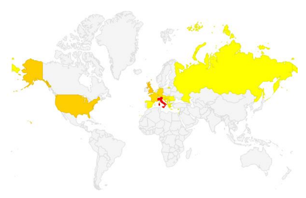
Figure 1 The EAGLE Best Practice Network Geographic Spread

This Section is taken from D6.5 Dissemination Report and it is reported here for the sake of completeness to summarise the main results of the project in terms of community building.