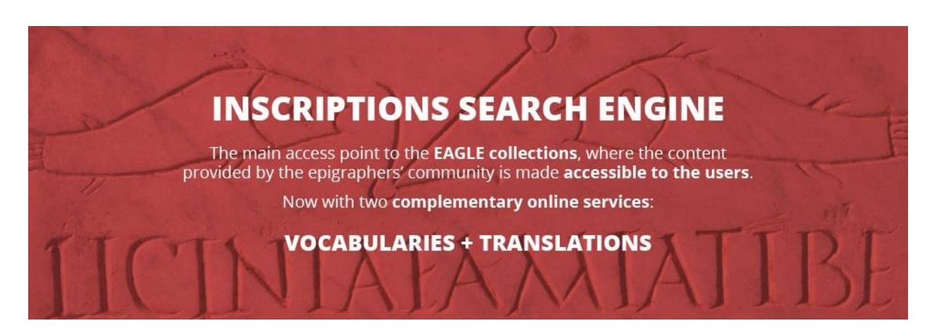
Figure 6 - Banner for the Vocabularies and the EAGLE Media Wiki

Translations in the Mediawiki are entered from sources outside the consortium and from new partners. The Mediawiki (available at <a href="http://www.eagle-network.eu/wiki">http://www.eagle-network.eu/wiki</a>), also allows to enter data: from registered independent users; from users submitting translations via Perseids integration, a editorial vetting system developed in collaboration with Perseus Project; from batch uploads with pywikipediabot (<a href="https://github.com/EAGLE-BPN/eagle-wiki">https://github.com/EAGLE-BPN/eagle-wiki</a>). All data are available to any users, to the EAGLE portal and to Content providers via a RESTful API native of Wikibase, the extension used for this purpose (<a href="https://www.eagle-network.eu/wiki/api.php">https://www.eagle-network.eu/wiki/api.php</a>).