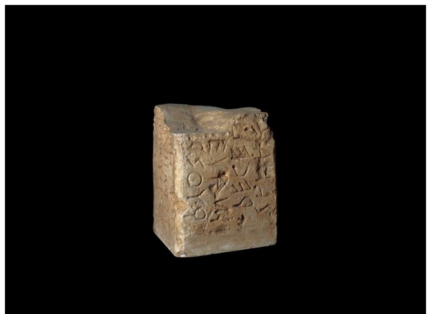
Figure 2 Forum Romanum, Cippus, Rome. Truncated obeliskoid cippus of Grotta Oscura (Veientine) tufa, in situ [...] in the Forum Romanum, Rome; unearthed in 1899 near the Rostra, under a black-marble pavement commonly since called the Lapis Niger. Late-6th (?) cent. B.C.

With 1.5 million items available, EAGLE is assembling a critical mass of cultural artifacts in the field of ancient Greek and Latin Epigraphy. By April 2016 the project had already far surpassed its goal, collecting more than 1 million items that are also already been published and are searchable on Europeana.