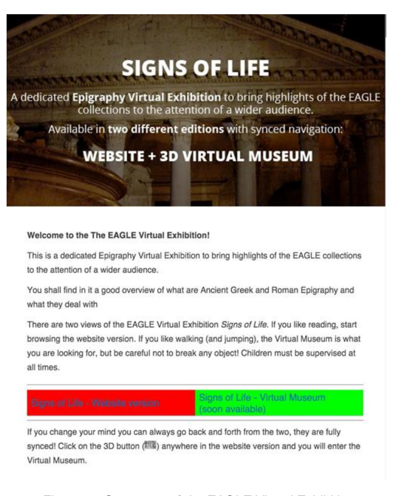
Figure 7 - Start page of the EAGLE Virtual Exhibition

There are two ways which the reader can access the Exhibition: reading the Web version or entering the virtual space for a fully interactive and immersive tour. In this way the user who likes more to delve into the contents reading them, can start from there; while the more interactive, game like user can experience the contents with a more physical approach, walking in a 3D environment. The contents presented in the two versions are the same, but tailored for the two different kind of users. From each page of the Web version the user can jump back into the virtual museum and vice versa, so that also a mixed tour is fully possible and the two ways of exploring the contents support one another. Wherever possible also connection to other EAGLE resources is given, especially to the EAGLE Storytelling application, the EAGLE Mediawiki and the EAGLE Vocabularies. it can be modulated and tailored to different types of CH.