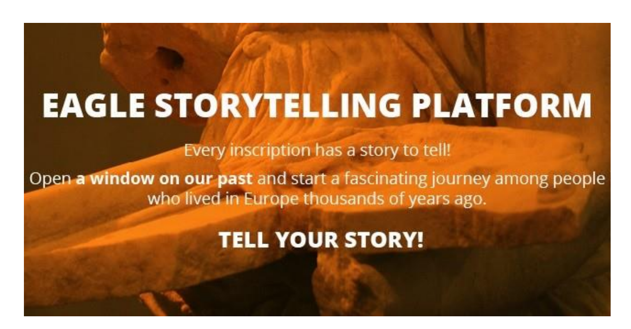
Figure 5 Banner for the EAGLE Storytelling Application

the included content (especially the inscriptions) has also been improved. The application now supports more data source and, in particular, it allows users to embed any Epidoc-compliant inscription published online, thanks to a generic renderer run on a dedicated server of the DAI. The developers of the applications agreed to extend support for the application beyond the life of the official EAGLE project.