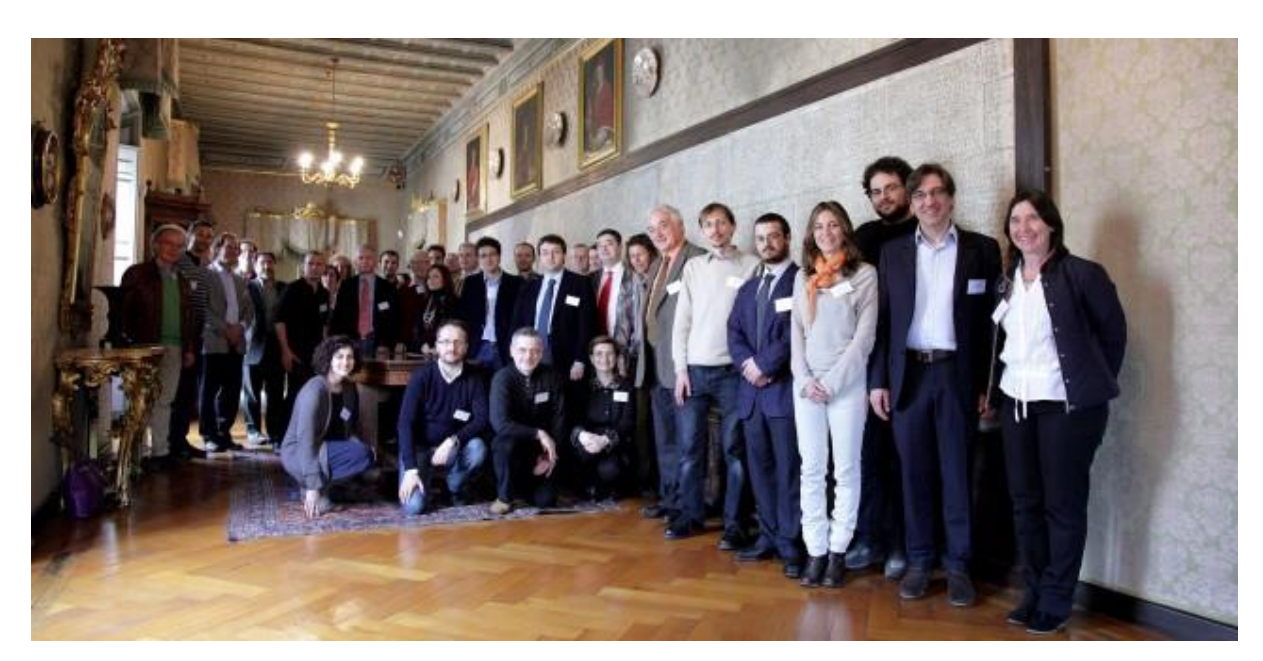
Figure 9 – Group portrait at the very beginning of the project (April 2013)

These include Horizon 2020 network meetings, as well as meetings with the Europeana network and the annual Digital Heritage conference.