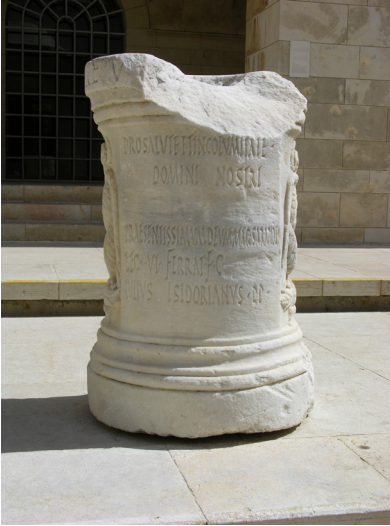
Fig. 11. Statue base from Caparcotna.