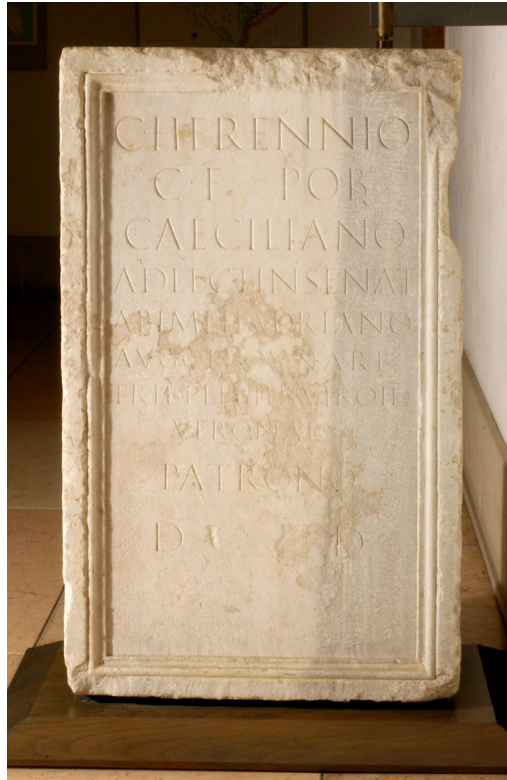
Fig. 4. Sirmione. Honorific monument for the senator C. Herennius Caecilianus.

The text is not particularly interesting with regard to its content. It only records the beginning of a senatorial career in the Hadrianic period. The young senator came apparently from Verona where he was also IIIvir iure dicundo and patron of the city. For this very reason the city wanted to honour him, naturally with a statue. This was also assumed by Albertini, who suggested a bronze statue. The text also appears in the EDR and EDH. 47