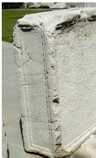
Fig. 9. Brescia. Pillar with erased inscription – lateral side.