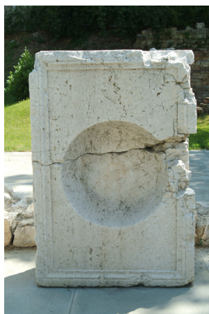
Fig. 10. Brescia. Pillar later reused.