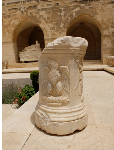
Fig. 12. Statue base from Caparcotna – sides with eagles and Victoria.