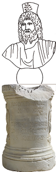
Fig. 16. Statue base from Caparcotna – reconstruction.

The representation of the god is not preserved, only the basis with the inscription like in most other dedications. Nevertheless, if one checks the forms in which Sarapis is figuratively represented, one immediately comes upon busts of the god which sits on a globe. With this observation, we also have immediately an explanation for the spherical form of the hollow carved on the upper part of the base. Here the lower part of a globe would sink, on which the bust of the god would likewise rest. This entire monument, the basis and the bust of the god was set up in a shrine and probably took an important place there (fig. 16). 57