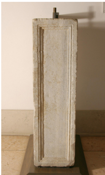
Fig. 6. Honorific monument for the senator C. Herennius Caecilianus – lateral side.