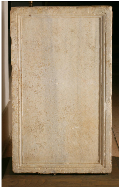
Fig. 5. Honorific monument for the senator C. Herennius Caecilianus – backside.