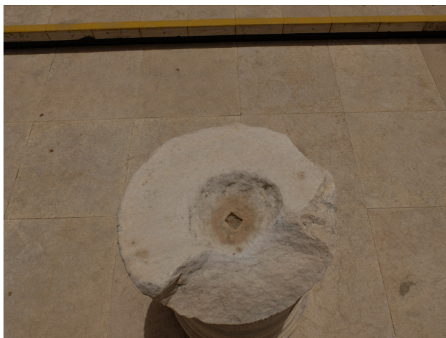
Fig. 15. Statue base from Caparcotna – upper side.

In the scholarly discussion, the monument was almost universally presented as an altar and logically considered as a dedication to the god Sarapis. Nevertheless, this understanding did not take into consideration the clear testimony of the inscription, in which it is written: praesentissimum deum Mag(num) Sarapidem . 56 This evidently means that Sarapis is not mentioned here as the one to which something was dedicated but rather that his figurative representation is the dedicated object. There is no doubt that a representation of Sarapis was set up as a votive gift, probably in a shrine, perhaps for Egyptian gods near the camp of the legio. The fact that a representation of Sarapis was dedicated means, consequently, that we are not dealing with an altar but with a base on which the representation found its place. Above all, it should not have been omitted from the beginning that there is a remarkable peculiarity on the upper side of the base, namely a completely rounded hollow with a diameter of 29 cm and a depth of 9 cm (fig. 15).