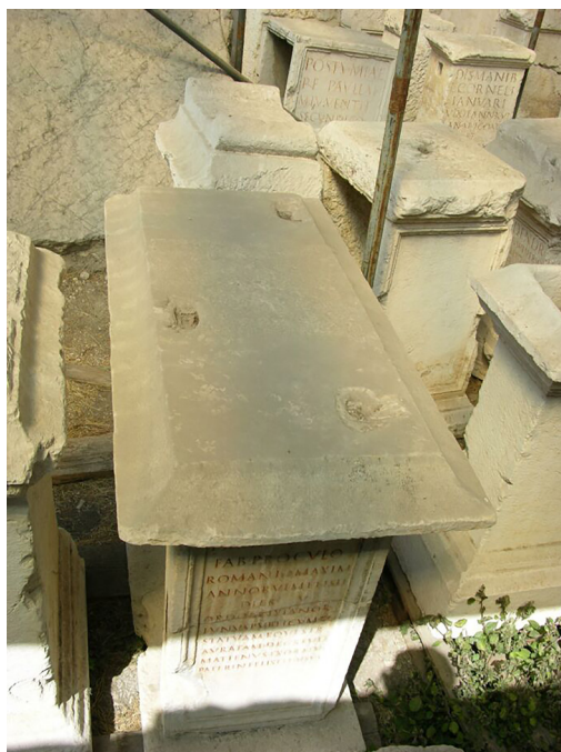
Fig. 3. Brescia. Example of equestrian statue base made of two pillars and a cover slab.

To the best of my knowledge, there is only one fully surviving example of this type, which is today kept in the museum of Brescia. (Fig. 3)