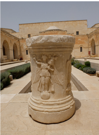
Fig. 13. Statue base from Caparcotna – sides with eagles and Victoria.