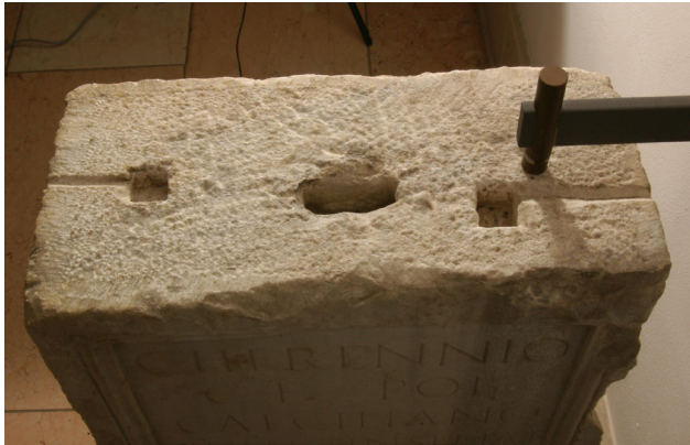
Fig. 7. Honorific monument for the senator C. Herennius Caecilianus – top side.

For this shows that the backside was elaborated with the intention to be exposed, a detail also observed by Albertini as he accordingly commented that the base (with the statue directly standing on it, in his view) was not adossata a una parete, ma eretta in uno spazio . 48 It is correct that the inscription could not have been adossata a una parete . However, both the first editor and all the others who dealt with the inscription thereafter have simply not wondered how, then, could the statue stand on a slab which is only 29 cm deep (fig. 7).