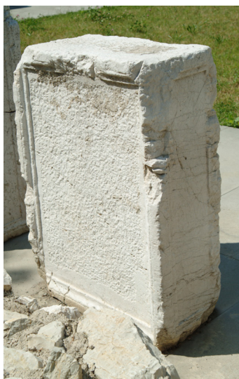
Fig. 8. Brescia. Pillar with erased inscription.

the posthumous monument of Matienus Proculus in the Museum of Brescia, but also by two other pillars in the same museum, which are very similar to the monument of Herennius Caecilianus; these too are elaborated on the backside with the intention to be exposed. One of the pillars bore once an inscription that was later erased, 49 which makes it impossible to know who was honoured in such a way (fig. 8-10).