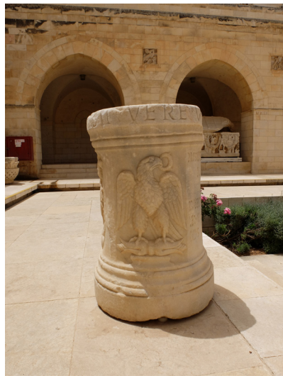
Fig. 14. Statue base from Caparcotna – sides with eagles and Victoria.